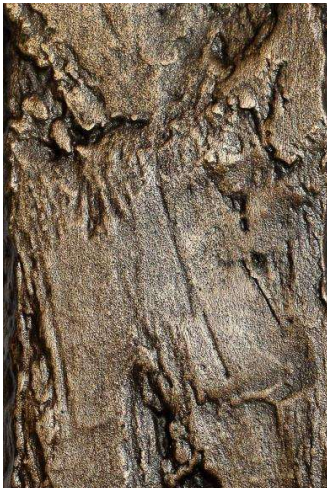
CAST BRONZE MEDIUM BROWN