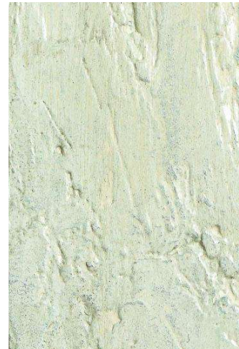
CAST BRONZE WHITE PATINA