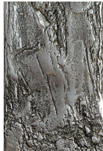
CAST ALUMINIUM POLISHED