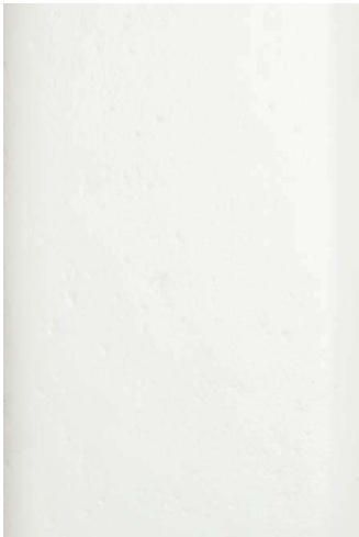
RESIN COATED POLYSTYRENE - OFF WHITE PAINTED