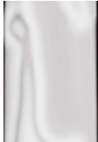
RESIN COATED POLYSTYRENE - CHROME PAINTED