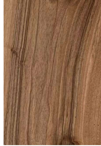
SOLID WOOD NATIONAL WALNUT