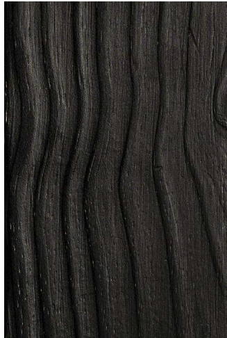
SOLID WOOD CHARRED