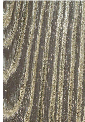
SOLID WOOD LIQUID METAL (SILVER)