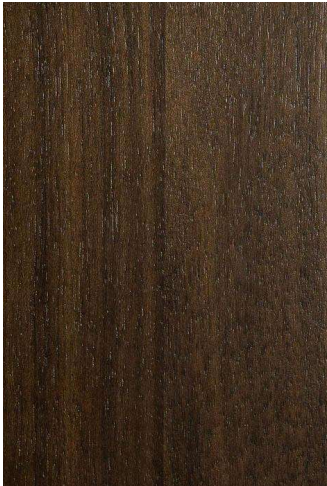
SOLID WOOD WALNUT