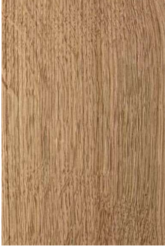
SOLID WOOD OAK