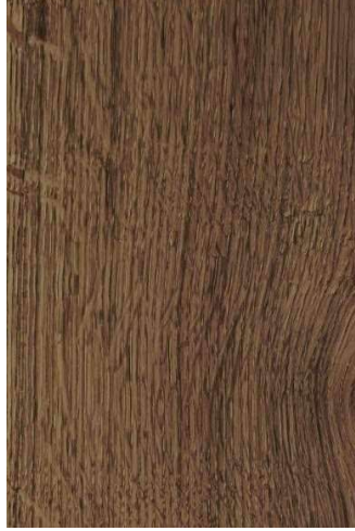
SOLID WOOD OAK BROWN