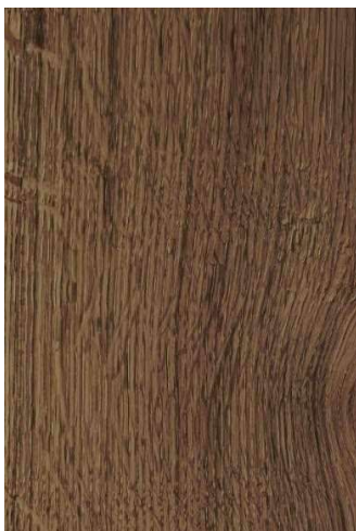
SOLID WOOD OAK BROWN