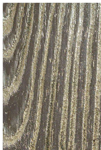
SOLID WOOD LIQUID METAL (SILVER)