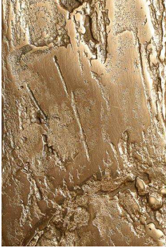
CAST BRONZE POLISHED