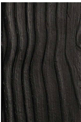
SOLID WOOD CHARRED